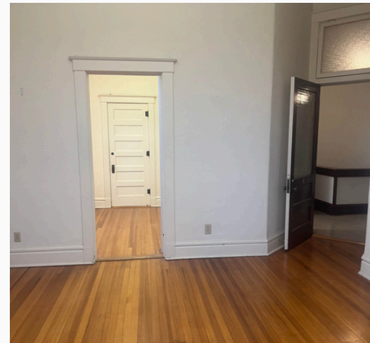
Upper story commercial space within a charming historic building