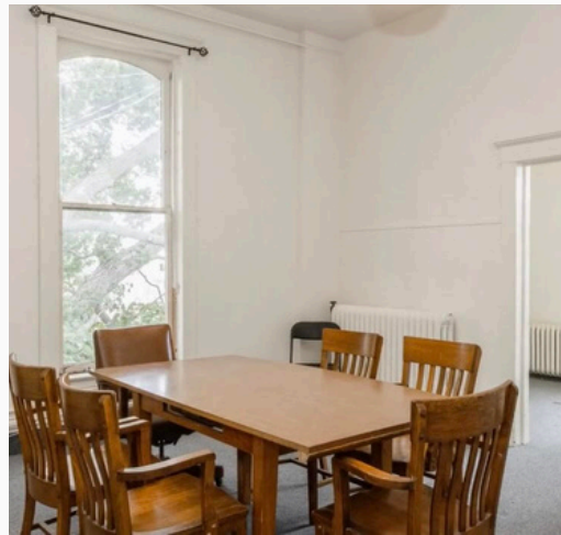
Beautiful view of Historic Main Street West Branch