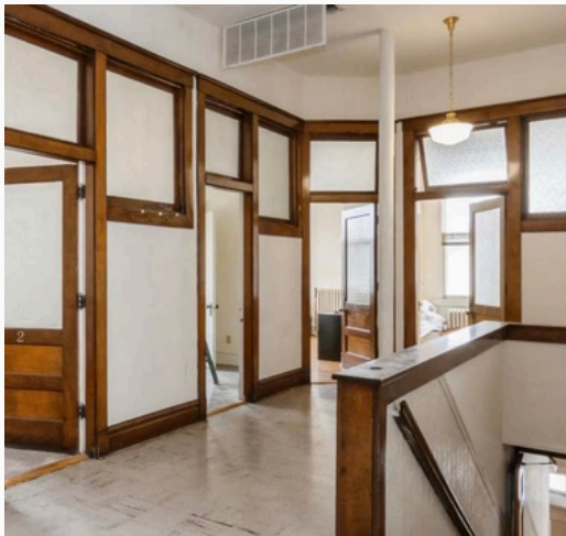
Private Offices with Shared Kitchen and Restroom