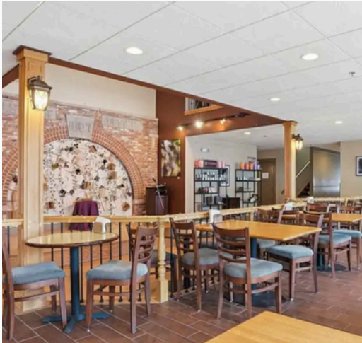
Large two-story dining area.