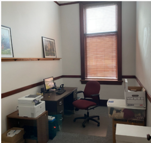
2 offices / back rooms with large front room