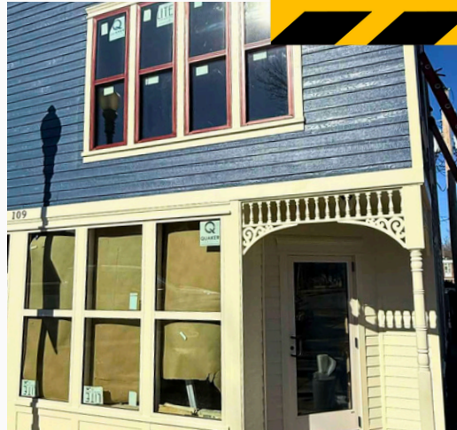
Interior renovating happening now!