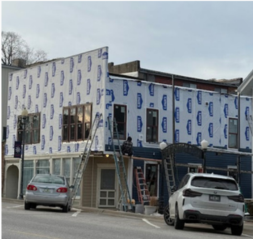
Exterior just updated!