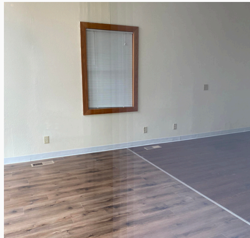
Great Starter Space