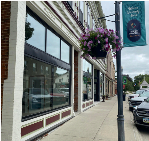
Charming Main Street District