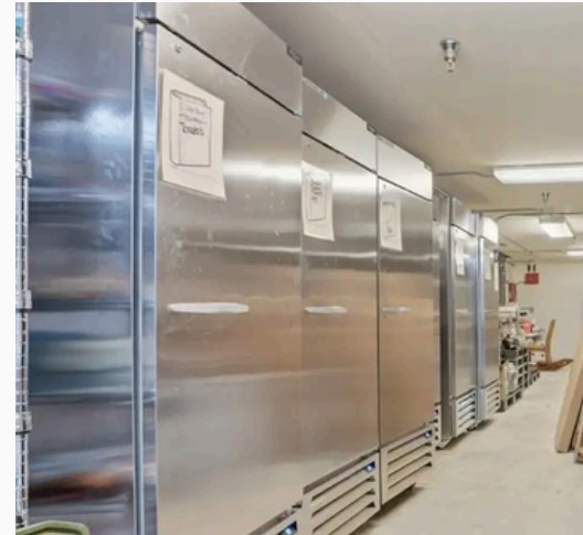
All Equipment Included.