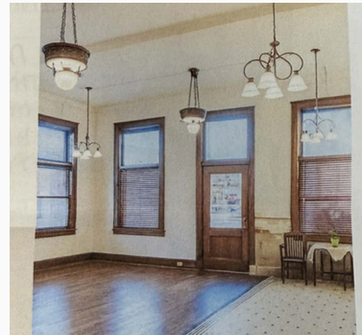
Mock up with historic teller stations removed