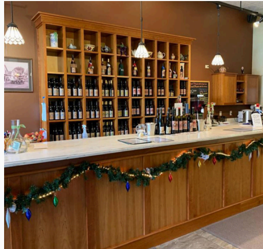
Tasting room with elegant bar.