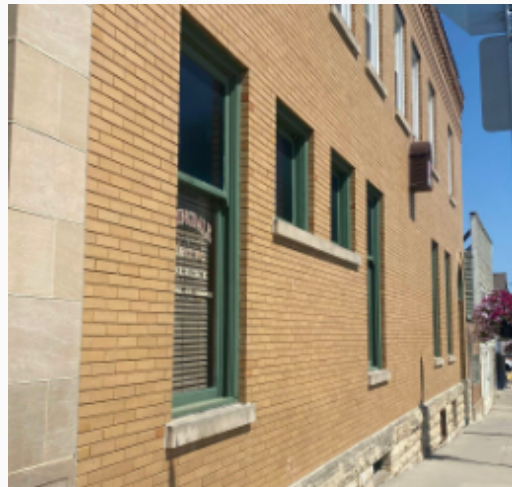
Large cornerstone building, build out negotiable