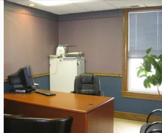
Custom build out negotiable