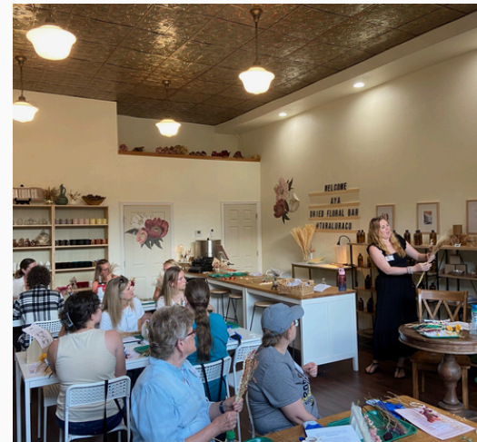
Recently Restored Building

109 N DOWNEY STREET STOREFRONT - $600-$700/MONTH